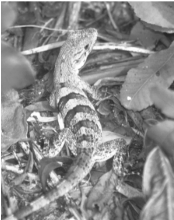
Juvenile Ctenosaura similis , Key Biscayne.