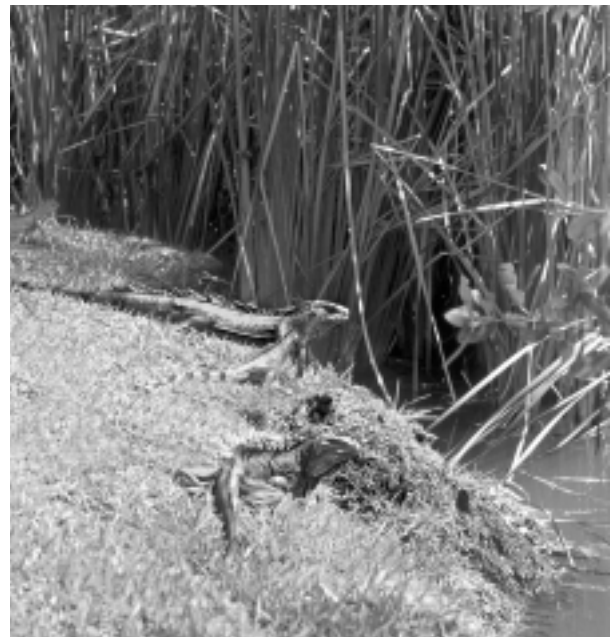
Three Green Iguanas ( Iguana iguana ) sit at canal's edge, Key Biscayne.