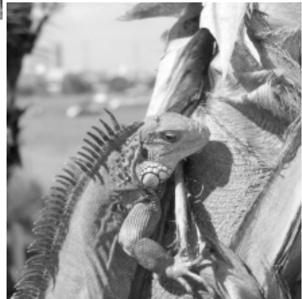
A Green Iguana ( Iguana iguana ) makes itself at home on a Coconut Palm ( Cocos nucifera ) in downtown Miami.

porarily reduce numbers (see IGUANA 10(3):98). Interestingly, many I. iguana have learned to seek shelter in burrows or under buildings, and we have observed I. iguana taking refuge under water, exposing only their snouts for breathing, to escape extremely cold temperatures.