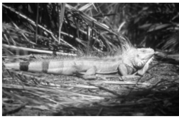
Three species of iguanas have become established in southern Florida: Ctenosaura pectinata , from near Old Cutler Road (top), southeastern Miami-Dade County, and adult male Ctenosaura similis (middle), and Iguana iguana from Key Biscayne (bottom).

uals being intentionally released by or escaping from reptile dealers or pet owners. As the trade in reptiles and amphibians has increased, so has the number of exotic species that have become established. Some of the more notable, and noticeable, of these species are three large lizards in the family Iguanidae ( sensu Frost et al. 2001): the Mexican Spiny-tailed Iguana, Ctenosaura pectinata (Wiegmann), the Black Spiny-tailed Iguana, C. similis (Gray), and the Green or Common Iguana, Iguana iguana (Linnaeus).