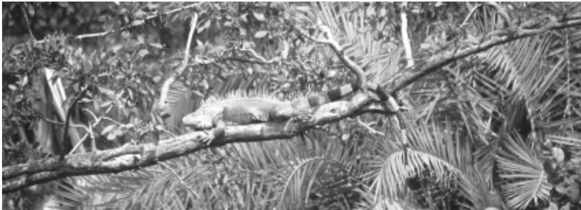
Adult male Iguana iguana , Key Biscayne.