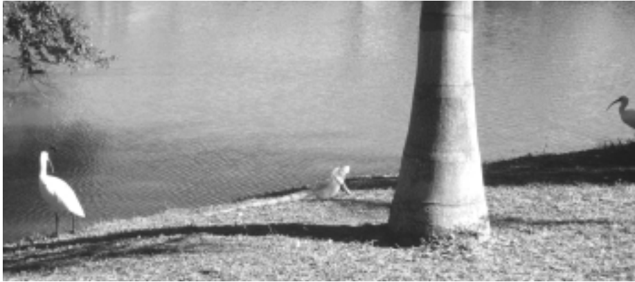
A Green Iguana ( Iguana iguana ) shares the shoreline with White Ibises ( Eudocimus albus ) in a Miami park.

Green Iguanas, such as this juvenile, are a common sight in and around the Colobus Monkey exhibit at the Miami Zoo.