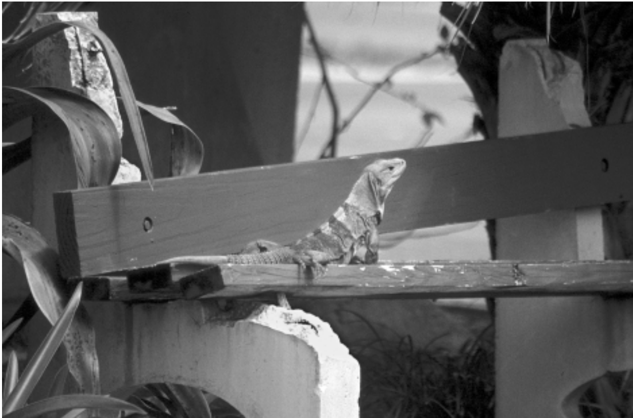
Adult female Ctenosaura similis on Key Biscayne using an old park bench as a basking site.

Schwartz 1958, King and Krakauer 1966, Wilson and Porras 1983, Butterfield et al. 1997), and more than 40 non-native species are presently reported. These reptiles and amphibians were initially introduced and their populations are supplemented via various routes. Some of these exotics may find their way into the suitable climate of southern Florida as stowaways in shipments of ornamental plants and other commerce, but many recent introductions can be attributed to individ-