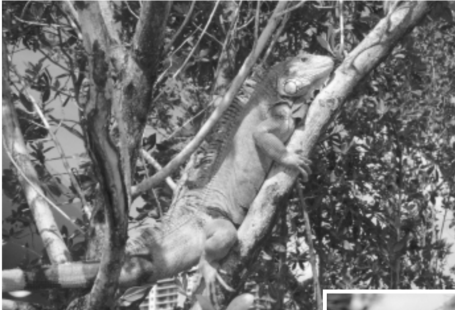
A Buttonwood Tree ( Cornocarpus erectus ) provides food and a place to bask for this Green Iguana ( Iguana iguana ) on Watson Island in Miami.