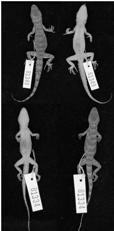
Figure 1. Cyrtopodion stoliczkai (Steindachner, 1867) - dorsal and ventral views of adult (UF 81349) and subadult specimen (UF 81334) similar in size to holotype of Alsophylax (Altiphylax) boehmei (Szczerbak, 1991); both specimens collected near Skardu Airport, ca. 10 km. west of Skardu, FANA, Pakistan.