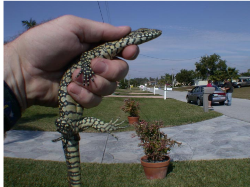
Figure 1 (above). Hatchling Nile Monitors retail for as little as $10 at pet stores, though their nervous disposition and large adult size make them unsuited for life in captivity.

The Cape Coral peninsula was historically mesic slash pine ( Pinus elliotii ) flatwoods and tidal swamp (Wesemann 1986). Canal construction and development of Cape Coral began in the late 1950s (Bernard 1983, Dodrill 1993), and by 2000, this fast-growing community had a population of 102,286 residents, which represented a 36.3% increase since 1990 (Cape Coral 2003b). The west side of the peninsula still contains an extensive tidal swamp of mangroves ( Avicennia germinans , Laguncularia racemosa , and Rhizophora mangle ) in the Charlotte Har-