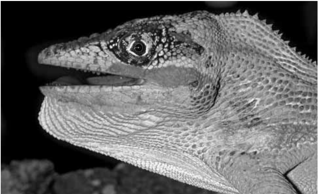
Juvenile Anolis equestris (UF 131530) from Port Mayaca, Martin County, Florida, found sleeping on low vegetation.