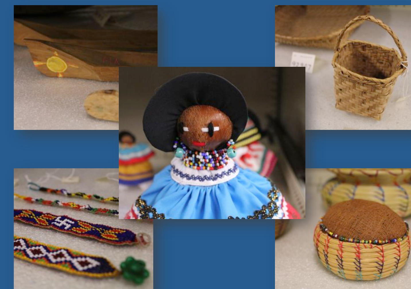
Artifacts from the Florida Ethnographic Collection.

The Florida Ethnographic Collection (FEC) at the Florida Museum of Natural History (FLMNH) is comprised of more than 800 Seminole and Miccosukee artifacts, photographs and documents. The artifacts, some of which date back to the 1800's, demonstrate extraordinary artistry and craftsmanship and are an integral part of Florida's heritage. For years, these materials were housed in a crowded room with thousands of other ethnographic artifacts from around the world, often indiscriminately or inconsistently organized. In 2011, as plans for a dramatic expansion of the FEC drew near, FLMNH designated more than $26,000 in funds towards the purchase of a mobile storage system with archival quality cabinets and drawers. Thus, the FEC would be united as a "collection" for the first time, moving from the Ethnographic Storage Room to the Special Collections Room.