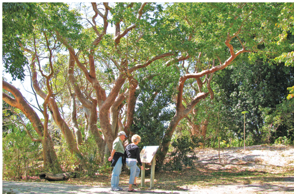
Visitors enjoy the interpretive sign next to a stand of gumbo limbo trees. Brown's Complex Mound 2 is to the right.

Other parts of the tree have also been used. Escalante Fontaneda, who lived among the Calusa,