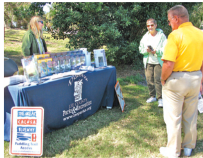
Visitors learn about Lee County's "Great Calusa Blueway," a marked canoe and kayak trail. The Calusa Heritage Trail is listed as a destination on the Blueway map.