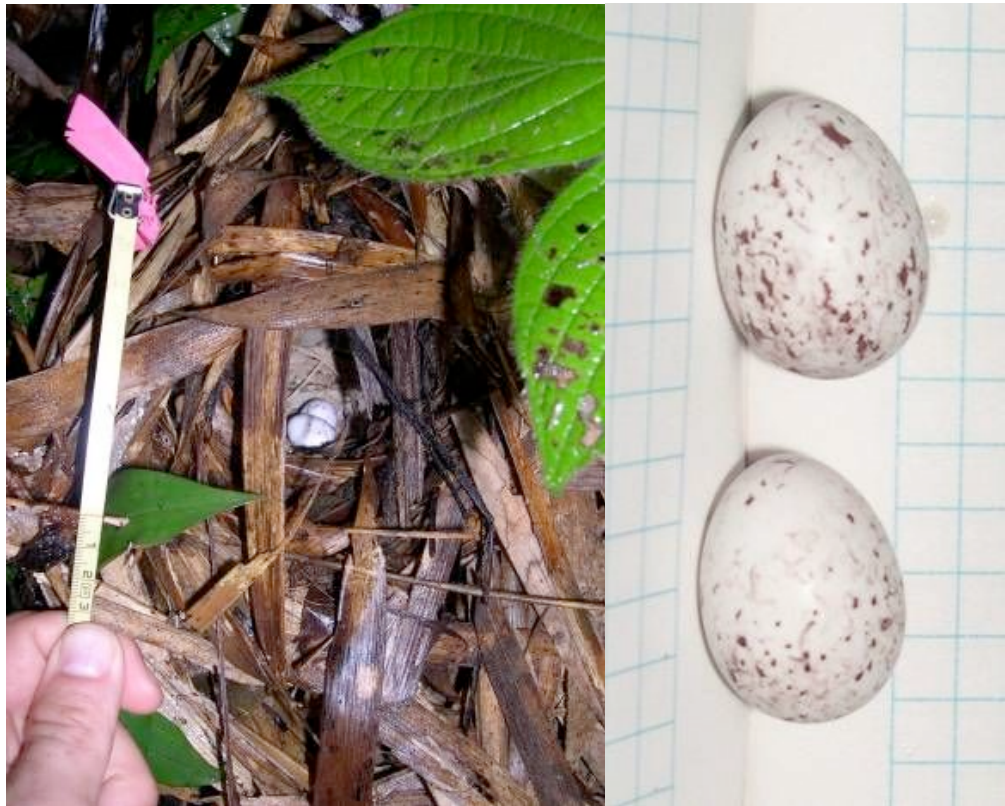
Fig. 4. White-browed Antbird nest (with cm rule for scale) and two-egg clutch (on 0.5 cm grid paper) at CICRA, Los Amigos, in July 2004.

underparts. Their rictal flanges were pale yellow-white and their palates were yellow. Feather pins were beginning to emerge from the skin on their backs and wings (Fig. 5). Our findings are similar to previous nest descriptions of this species and other Myrmoborus (Londoño 2003, Zimmer & Isler 2003). Additionally, we observed a female preening a male on 3 November 2004 in bamboo near CICRA. This observation enlarges the list of antbird genera observed to allopreen. Allopreening has been observed in the antbird genera Thamnophilus , Cercomacra , Hylophylax , and Gymnopithys , with the female usually being the receiver, and this behavior appears to reinforce pair-bonds in response to territorial disputes with conspecifics (Zimmer & Isler 2003). Courtship feeding of the female by the male is a common behavioral prelude to pair formation and copulation for many antbird species (Zimmer & Isler 2003), and allopreening possibly serves a similar function.