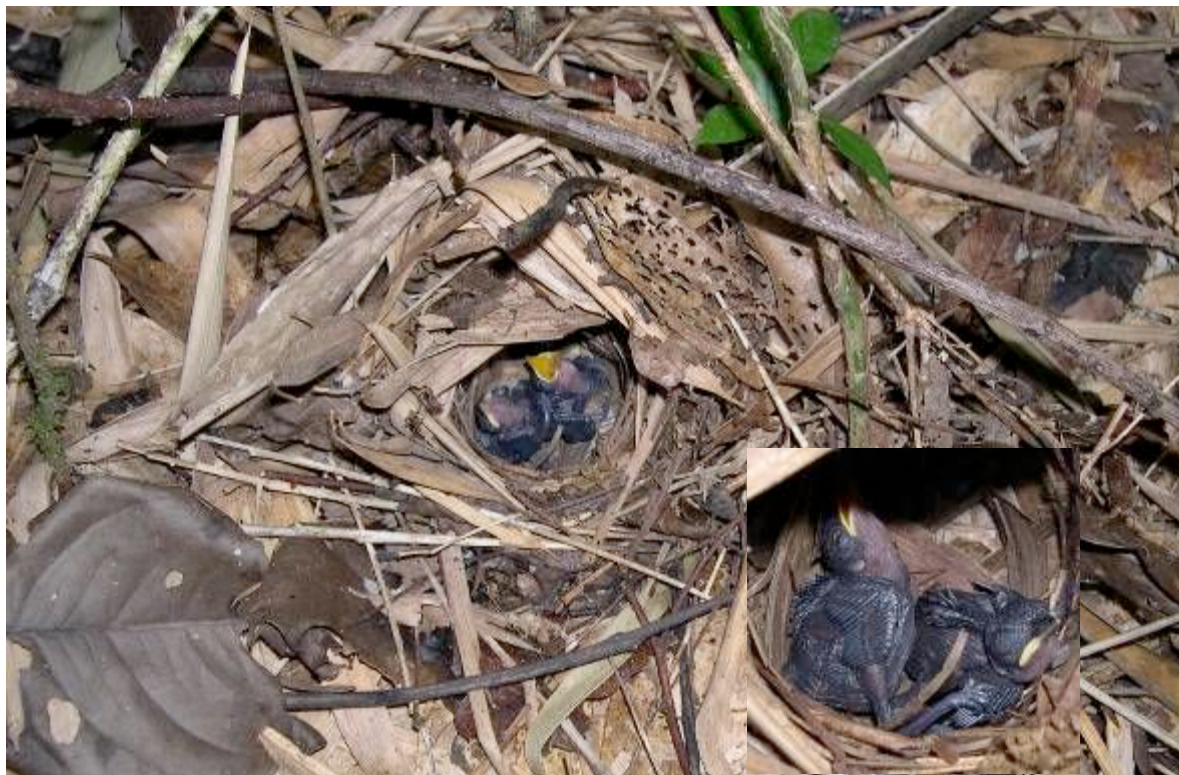
Fig. 5. White-browed Antbird nest and nestlings (inset) near CM1, Los Amigos, in early September 2004.

Goeldi's Antbird ( Myrmeciza goeldii ). We flushed an adult female off a nest containing one egg on 5 October 2004 near CICRA (Fig. 6). Afterwards, we quickly measured and photographed the nest to minimize disturbance and were unable to return later to collect more data. The nest was located on the ground in a dense successional riparian forest thicket, characterized by many lianas, Heliconia , and ground bromeliads, but no Guadua bamboo. The nest was made of leaves and twigs, with the nest cup hidden underneath a domed structure of leafy debris and accessible by a side entrance. Externally, the nest measured 20 cm wide, 13.5 cm tall, and 15 cm front to back. The internal egg cup