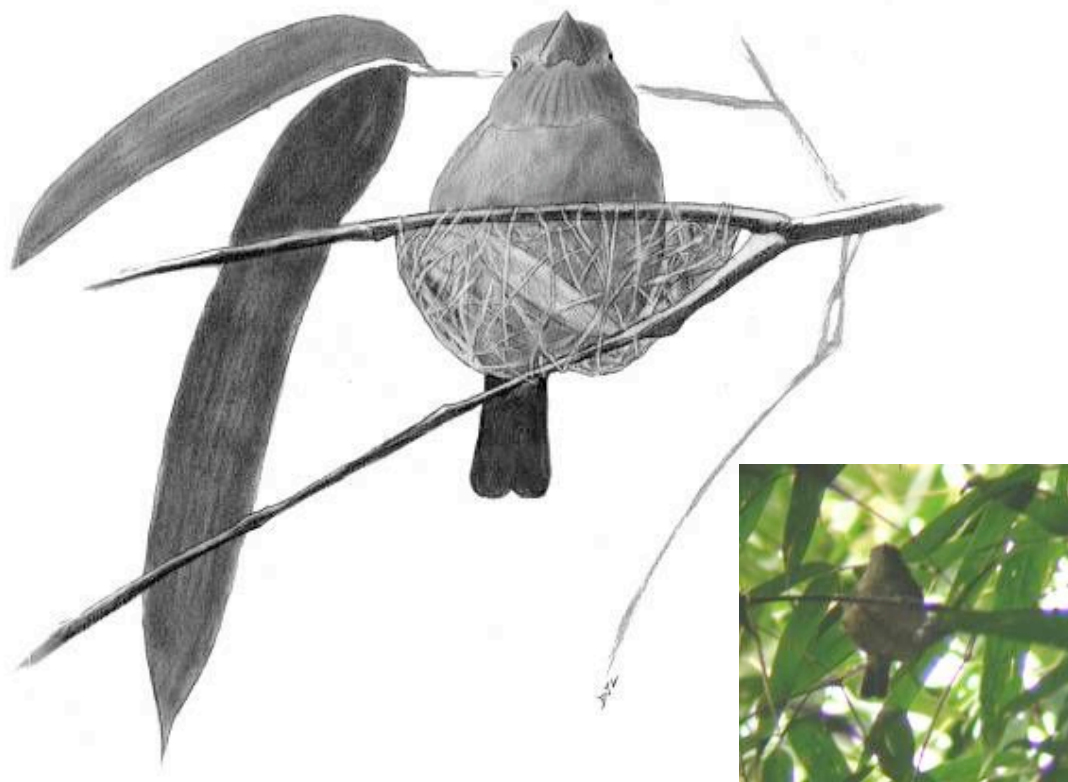
Fig. 7. Sulphur-bellied Tyrant-Manakin nest under construction. Illustration based on photograph (inset) and field sketches (photo and illustration: DJL).

Long-crested Pygmy-Tyrant ( Lophotriccus eulophotes ). On 13 March 2004, we observed a group of three birds, including a begging juvenile, near the edge of disturbed terra firme forest near CICRA. On 19 June 2004, we captured and photographed a juvenile with pale