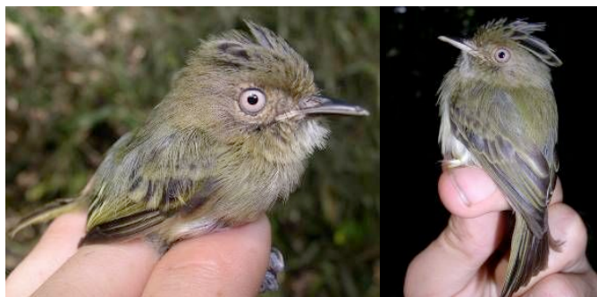
Fig. 8. Juvenile (left) and adult (right) Long-crested Pygmy-Tyrant. Note short crest plumes and more prominent rictal flanges in juvenile.

yellow rictal flanges and short crest feathers in Guadua bamboo near CICRA (Fig. 8). No breeding information for this species was previously available (Fitzpatrick et al. 2004).