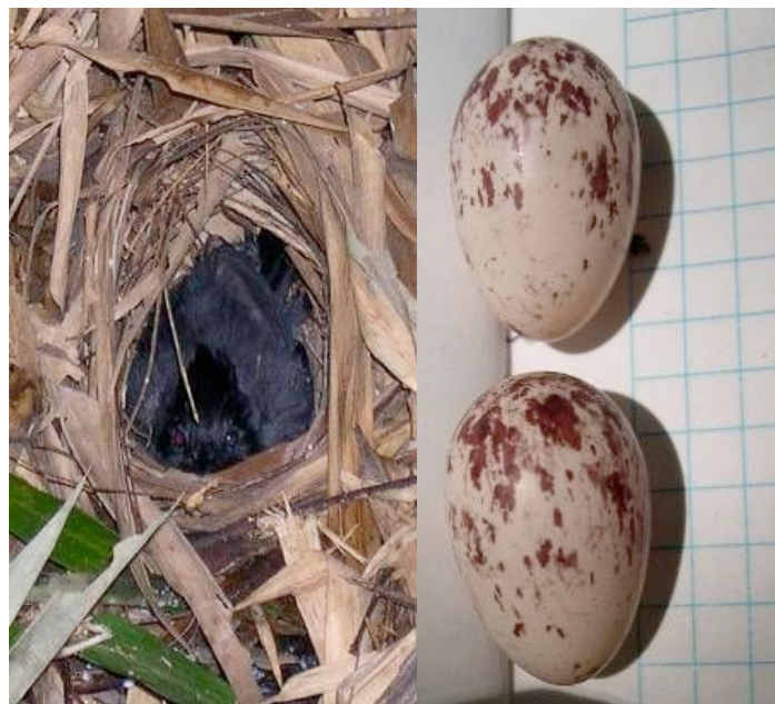
Fig. 3. Male White-lined Antbird incubating (left) a clutch of two eggs (right, on 0.5 cm grid paper).