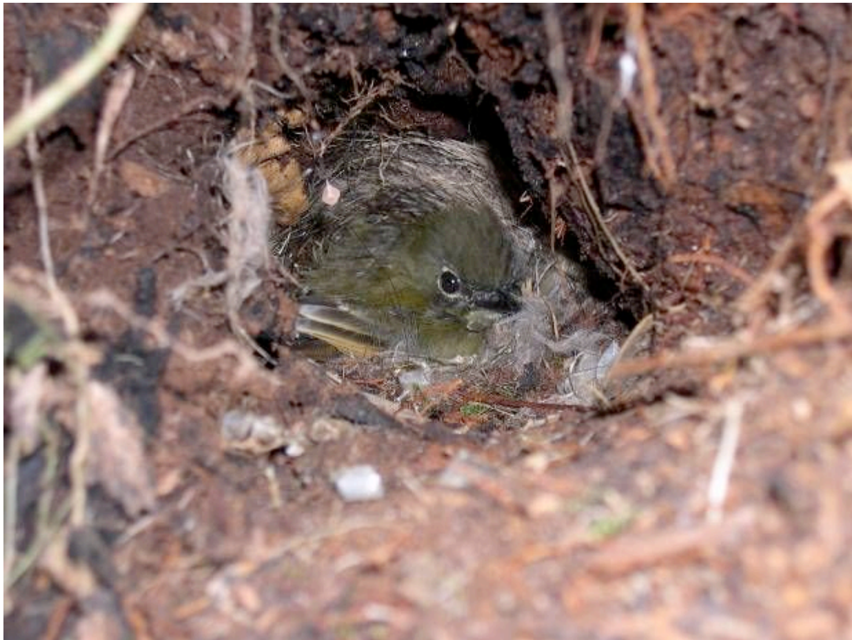
Fig. 9. Dusky-tailed Flatbill on nest within cavity on 24 July 2004 near CICRA, Los Amigos.

cavity and eggs. The nest was located in a natural cavity in a rotten tree limb, 26 cm in diameter and inclined at a 40° angle. The entrance measured 8 cm wide, 11 cm tall, and was 41 cm off the ground. The cavity depth was ~31 cm. The nest was lined with fine plant fiber, gray down, leaves, mammal (likely peccary) hair, and translucent snakeskin. Parker (1984) reports similar nest placement and construction among Ramphotrigon species, with nests including mammal hair (but not snake skin). The eggs were tan, with burgundy stripe-splotches. The three eggs measured 20.4 x 14.8 mm, 19.4 x 14.8 mm, and 20.2 x 15.1 mm. Parker (1984) reports a clutch size of two for this species and a clutch size of three for the Rufous-tailed Flatbill ( R. ruficauda ).