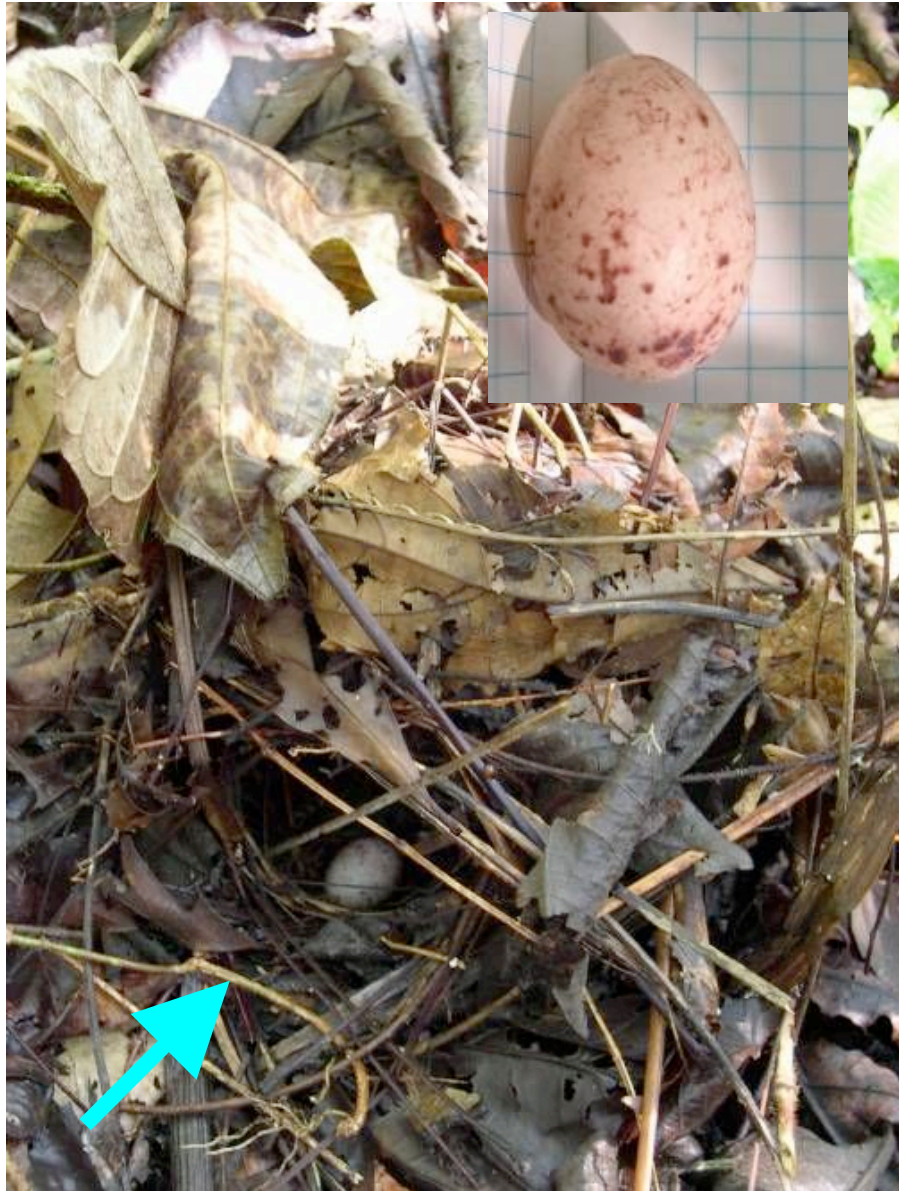
Fig. 6. Nest and egg (on 0.5 cm grid paper, inset) of Goeldi's Antbird on 5 October 2004 near CICRA, Los Amigos. Note the large amount of twigs and leaves piled above the cup portion of the nest.

Sulphur-bellied Tyrant-Manakin ( Neopelma sulphureiventer ). We observed an individual (presumably female) actively constructing a nest (Fig. 7) on 16 October 2004, within a Guadua bamboo patch at Oceania. We were unable to follow this nest to completion. The partially completed nest was a thin, shallow cup of woven bamboo fibers, slung between two tertiary bamboo branches, 10-11 m up in bamboo. It resembled manakin nests in structure (Foster 1976,