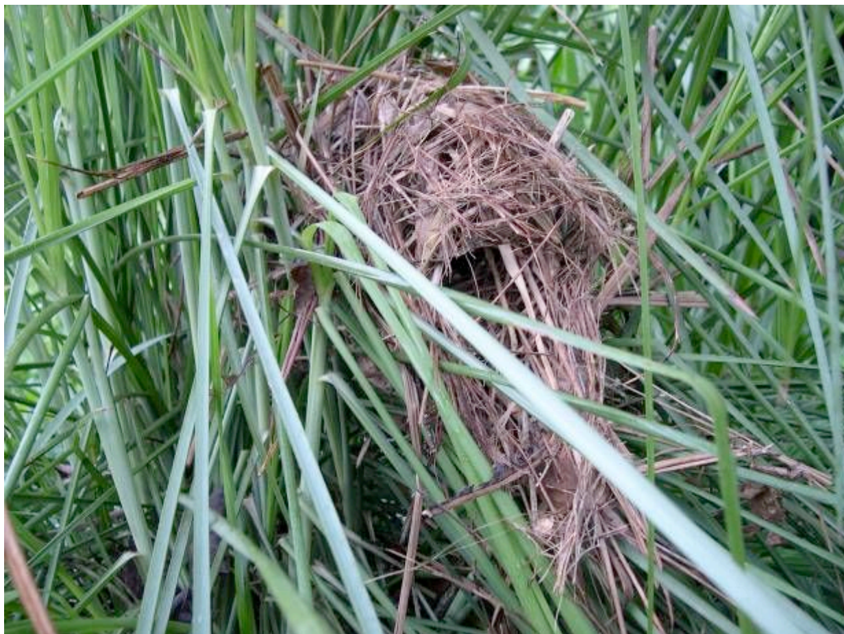
Fig. 10. Moustached Wren nest on 4 November 2004 at CICRA, Los Amigos.

6 cm tall, and was 45 cm off ground. The nest measured 17 cm wide at the top and 30 cm wide at the bottom, 13 cm back to front, and 17 cm tall. These are the first nesting observations of this species, and the nest structure is typical for the genus Thryothorus (Kroodasma & Brewer 2005).