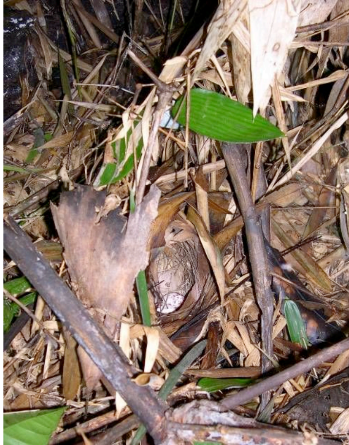
Fig. 2. White-lined Antbird nest with two eggs.