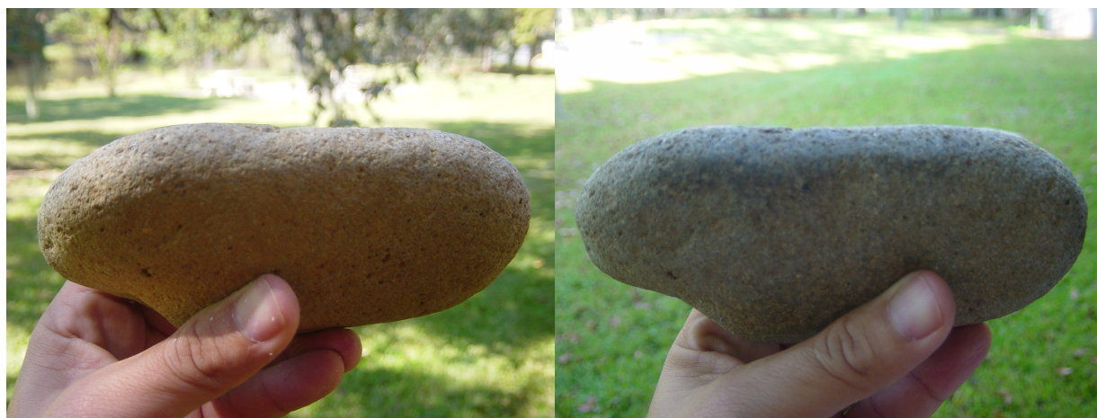
Figure 5. Specimen 1 unmodified (top) and after four hours of use (bottom).

and a half hour of work, while in specimen 4 no complete leveling of the use surface was produced even after the complete 12 hours of work had elapsed. This difference seems to be related to the original morphology of the use surface, as the one in specimen 3 was much more angular than that in specimen 4, which presented a more square outline. Both of these experimental specimens were made of basalt, and thus raw material hardness could be eliminated as a source of variation in the time taken for the formation of the facet, thus probably indicating that the original morphology of the use surface plays a major role in the time it takes for the creation of a discernible facet. It should also be noted that in specimen 4, the grinding wear of the side used for corn processing produced a brighter polish than the one employed to pound sweet potatoes. This could be a result of different factors, such as the higher silica content of maize, which serves as an abrasive agent during the grinding process. Also, the use of water when creating the paste and the oil contained in the kernels might have served as lubricants that increased the frictional energy of these materials, thus producing higher degrees of sheen (Adams 2002:36).