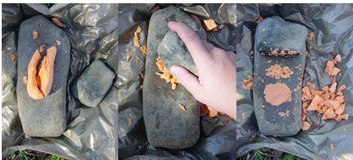
Figure 3. Sweet potato processing sequence.