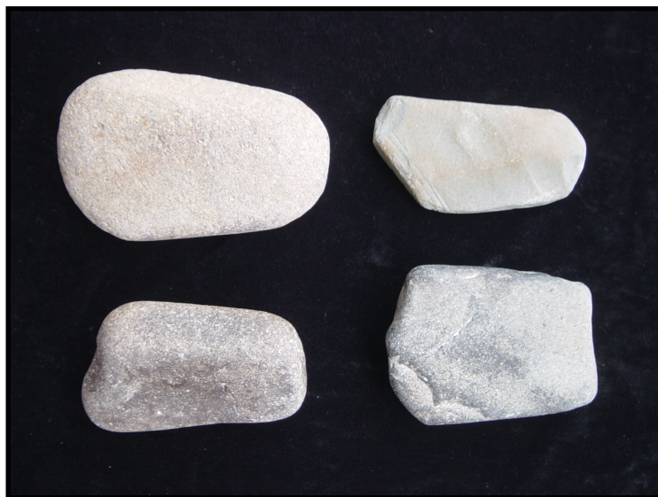
Figure 1. Experimental edge-ground cobbles. From clockwise from top left, specimens 1 through 4

Even though this artifact is of such high occurrence, its use(s) have never been formally tested in the Antilles. The only suggestions about its function have been based on morphological criteria, usually being generically defined as “grinding stones.” However, no direct evidence of this use estimation nor of the type(s) of material(s) that were processed with these have been provided thus far.