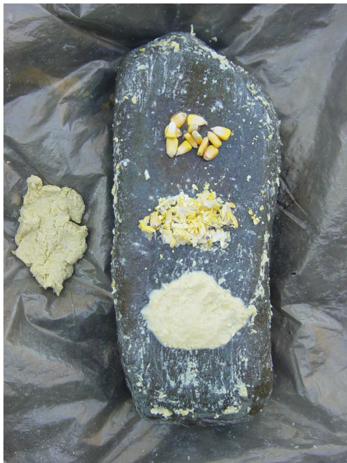
Figure 4. Corn processing stages.

although in cases where a discernable modification was observed in less time, it was recorded then. Two of the experimental cobbles were used to process manioc, another one maize, and the final one was employed on one side to process sweet potato and the other maize. During the experiment, the peeled tubers and maize grains were weighed before and after processing. For microscopic analysis, the protocol adhered to that developed by Adams (1989, 1999, 2002) for determining wear patterns on grinding tools. Each item was hand washed with tap water, and was then analyzed using a low magnification approach, varying from 10X to 70X. The wear patterns that were observed on the experimental specimens were then compared to those in the archaeological materials from