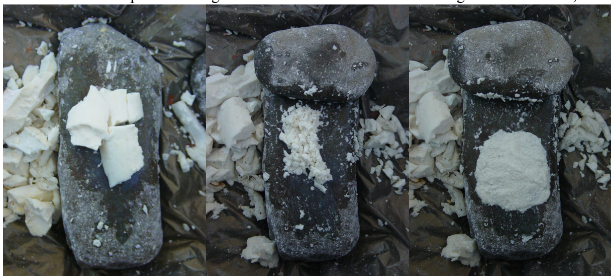
Figure 2. Manioc processing sequence.

Both sweet potatoes and manioc were initially split lengthwise along their fibers with the tool’s most pointed end, and then individual tuber fragments were pounded and ground perpendicular to their fibers, which seemed to be the most efficient method of reducing the tubers to a pulp (Figures 2 and 3). Similar to what has been done by Ranere (1980a:125), pounding was followed by dragging the material to the center of the milling stone. However, in