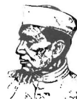
Birbal Sahni centenary, 1991